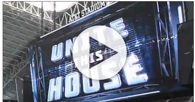
Watch Video: AT&T Stadium Brings The Game Closer with 5G and AR