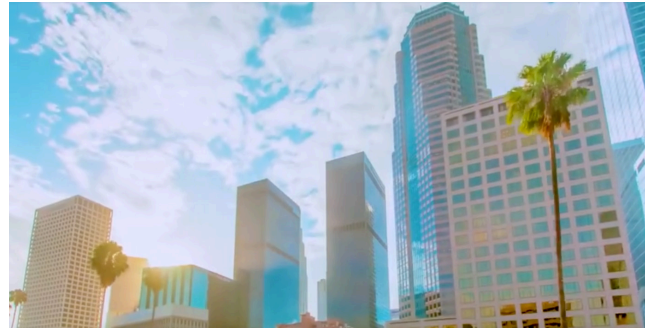
Watch: Early Warning Earthquake App | AT&T

ShakeAlertLA is based on seismic data from a West Coast-wide network of sensors that detect earthquakes. The sensors are placed along fault lines and send data to United States Geological Survey (USGS) scientists.